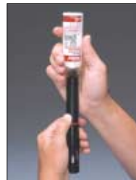
Refills in just 20 seconds with standard butane lighter fuel.