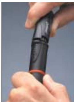
Automatic safety fuel cut-off when cap is replaced.